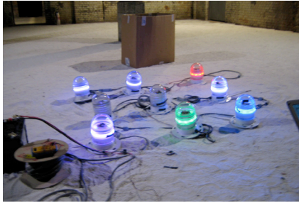
Fig. 3. Testing the RGB LED marine lanterns: a full size model or prototype.

tion technique at the ‘final’ scale and/or with the final materials. These models are more like prototypes. We ‘scaled’ in this way when we made a nine buoy prototype for Net Work to explore the way the lanterns displayed the cellular automata (CA).